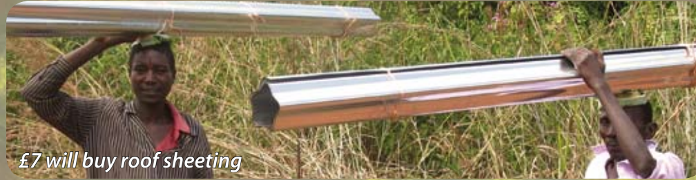
£7 will buy roof sheeting

£70 would purchase a robust bicycle to allow an evangelist to get around his local congregation to support them, so much easier. £1,000 would buy a motorbike for a busy pastor to minister to his widespread flock.